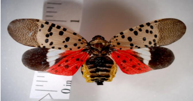
Adult Spotted Lanternfly.

County, Pennsylvania. The Spotted Lanternfly is a planthopper from Asia, specifically found in China, Korea, India, Vietnam, and parts of eastern Asia. In the United States, the species has the potential to greatly impact the grape, fruit tree, and logging industries. The Spotted Lanternfly attacks many hosts including grapes, apples, pines, stone fruits and more than 70 additional species. On 1 November 2014, the Commonwealth announced a quarantine with the intent to restrict the movement of this pest. This is the first detection of Spotted Lanternfly in the United States.