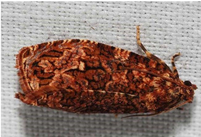
An olethreutine moth, Phaecasiophora fernaldana Walsingham (Lepidoptera: Tortricidae: Olethreutinae).

A 10 October 2014 U.S. Customs and Border Protection (CBP) news release reports that a U.S. Department of Agriculture (USDA) - Animal and Plant Health Inspection Service (APHIS) - Plant Protection and Quarantine (PPQ) identifier confirmed on 8 October 2014 that CBP agriculture specialists at the Lewiston Bridge border crossing discovered a first in nation olethreutine moth, Phaecasiophora fernaldana Walsingham (Lepidoptera: Tortricidae: Olethreutinae), on 6 October 2014 while inspecting a truck hauling an ocean container full of pump valves which originated in China. CBP issued an Emergency Action Notification to the importer and the shipment was re-exported to Canada.